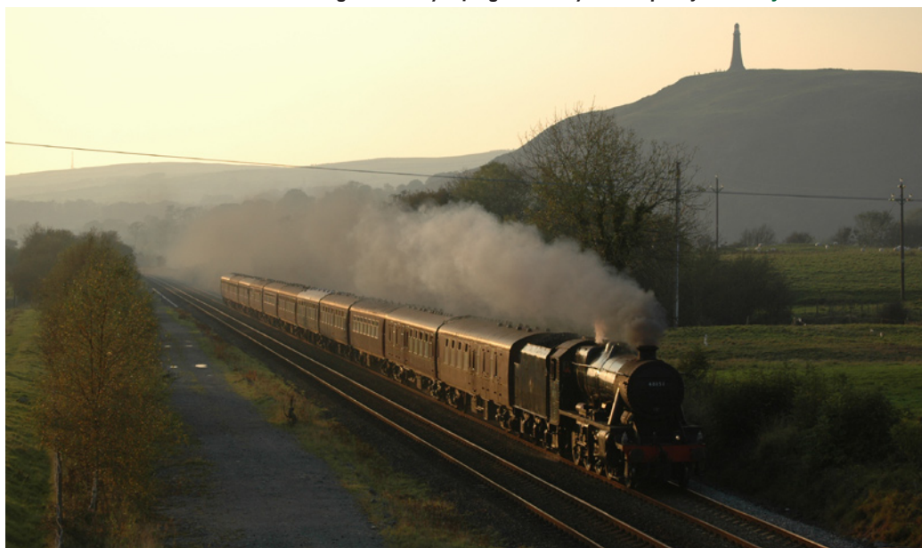
▼ With No. 6233 Duchess of Sutherland deemed out of gauge, PMR Tours utilised LMS Class 8F 2-8-0 No. 48151 on its Cumbrian Coast tour, seen here catching the last rays of a glorious day at Plumpton Junction. John Whitehouse