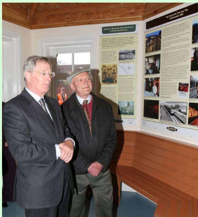
▲ His Royal Highness the Duke of Gloucester (left) visited Saunderton station recently for the opening of the Saunderton Railway Museum. The old waiting room had been boarded up since 1992 and Network Rail, Chiltern Railways and the residents of the local area formed a campaign group raising £25,000 to pay for the restoration. Chiltern Railways