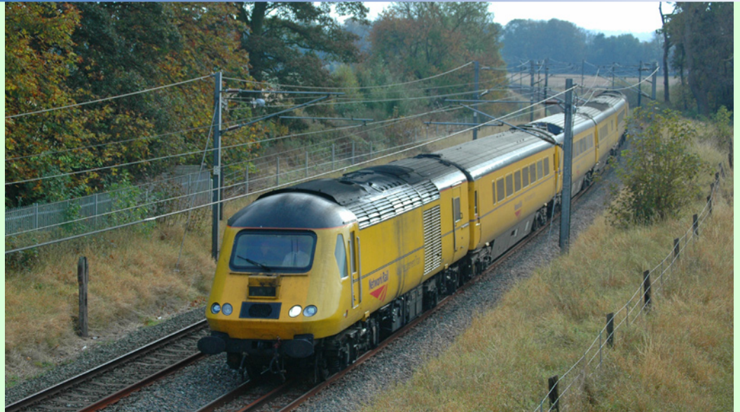
▲ Network Rail's New Measurement Train (with powercars Nos. 43013 and 43014) made a rare visit to Birmingham's Cross-City line on 24th October. Here, the set heads down the bank from Blake Street.

The trial will last two months, after which the participants will give feedback to the developers.