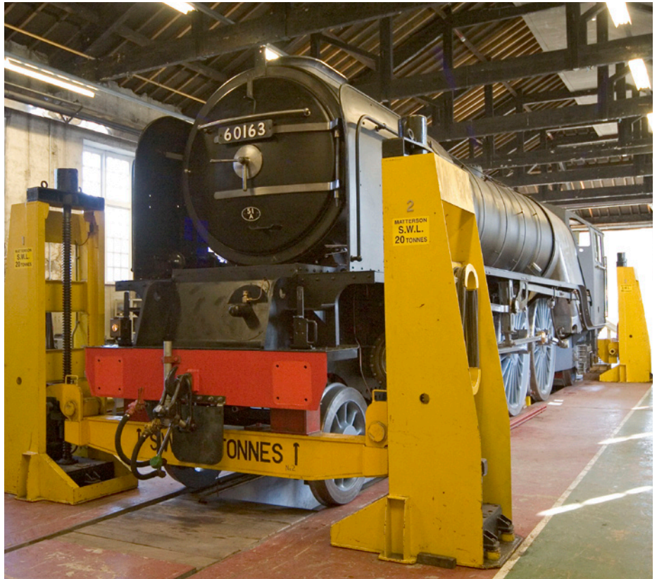
▲ The familiar outline of a Peppercorn AI Pacific, the likes of which has not been seen in steam since the last of the original build was scrapped in 1966.

In June, No. 60163 will move to York to be based there for a series of mainline test runs