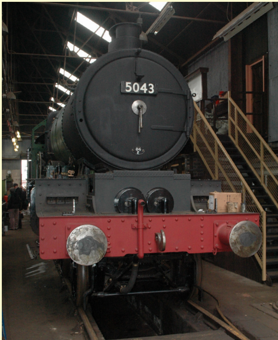
▲ The distinctive lines of a Great Western Railway 'Castle' class locomotive. No. 5043 Earl of Mount Edgumbe approaches completion at Tyseley on 22nd October.

Outside, at the head of the Vintage Trains chocolate and cream Mk2 rake, stood the company's recently overhauled Class 47/7 No. 47773, with classmate No. 47770 alongside, the latter still in weather-worn Res livery and thought to be next on the overhaul list. Meanwhile, at the rear of the works were Class 50s No. 50033 Glorious and D444 Exeter , the former awaiting attention before moving south