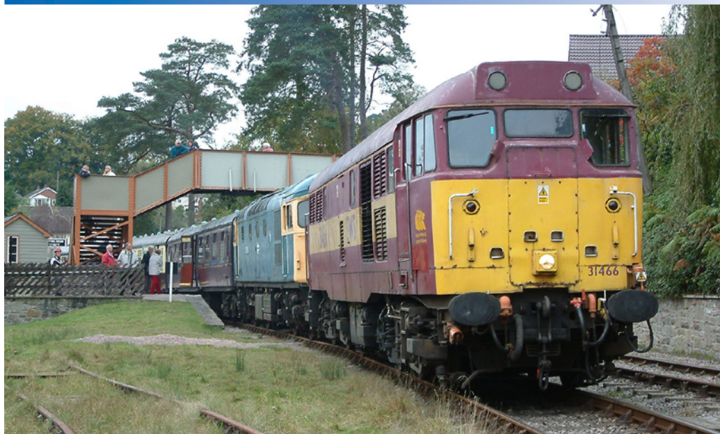
▲ Working its first trains in preservation and still retaining its EWS colour scheme, Class 31/4 No. 31466 awaits departure time, before piloting Class 27 No. 27066 on the 16.00 Parkend to Lydney Junction service on the Dean Forest Railway on 24th October. Jeff Booth

The railway by-laws and information for enthusiasts are also available online from the Network Rail website, by clicking here .