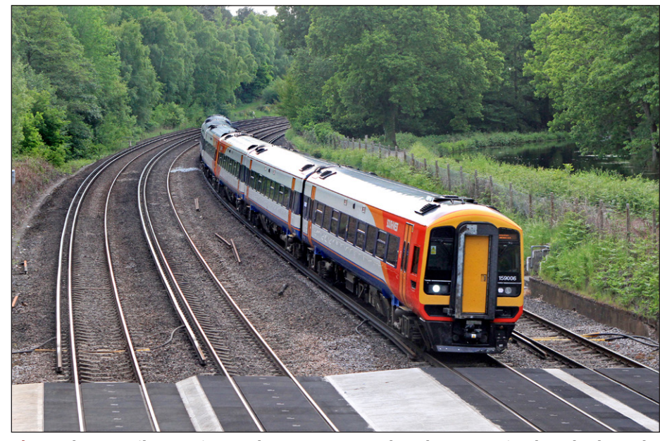
Above: The UK Railtours trip on 9th June was not only a charter service, but also brought a wider recognition to one of the destinations when Class 159/0 No. 159006 was named Seaton Tramway after arrival at Axminster. The return working to London Waterloo is pictured passing Pirbight.