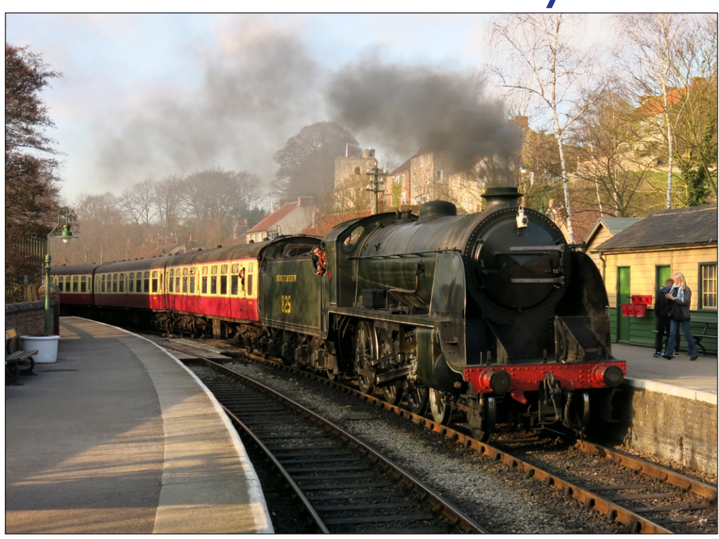
Above: Maunsell SR S15 class 4-6-0 No. 825 is currently the only operational member of the class out of a total of seven survivors. However, it is expected to bow out of traffic this coming weekend for major overhaul. Here, the popular locomotive arrives at Pickering with a service from Grosmont on the evening of 6th April.

Sir Nigel Gresley is the post-war speed record holder for steam traction of 112mph and will be heading to the NRM to help