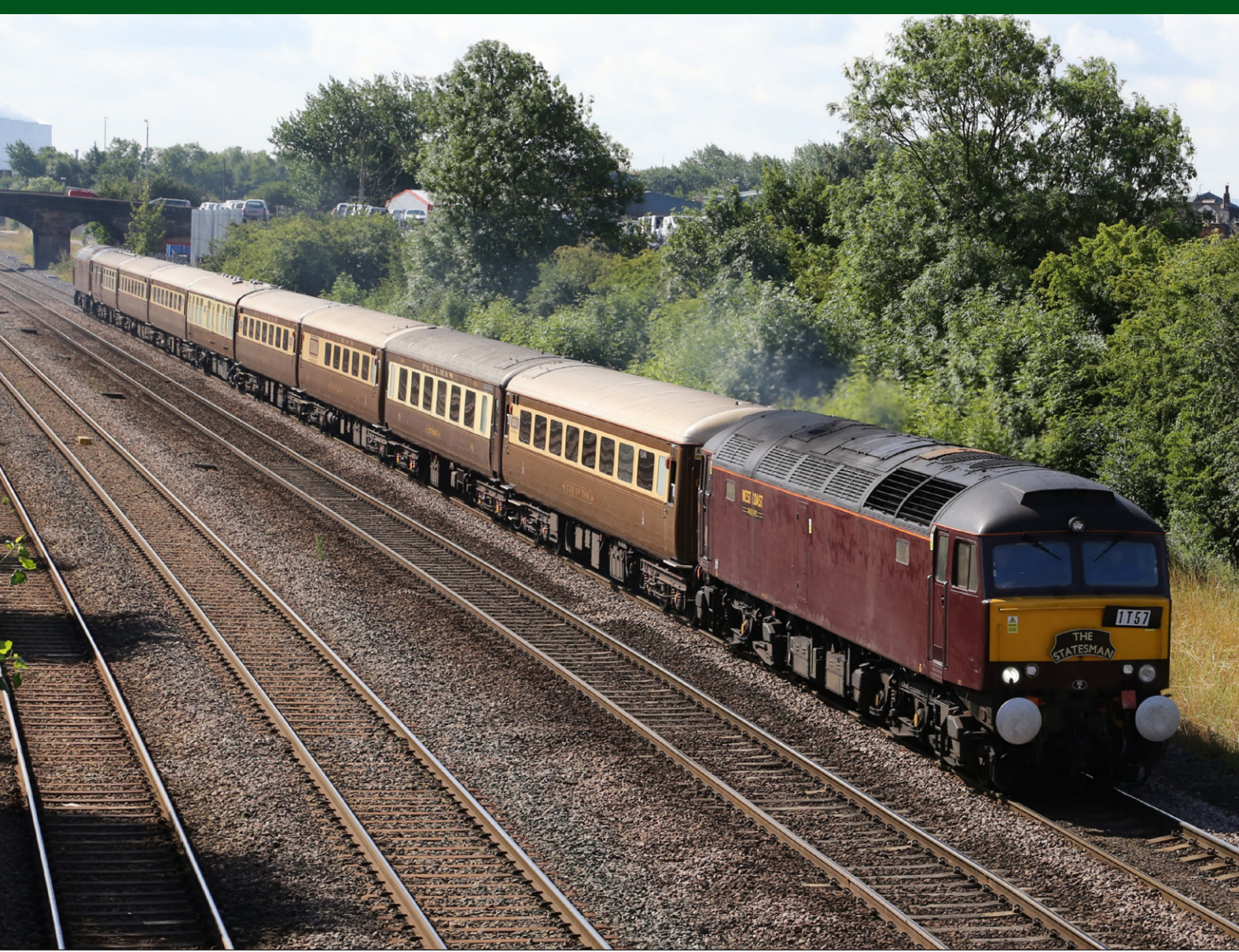
Above: West Coast Railways Class 57/6 No. 57601 leads the 'Edinburgh Military Tatoo Statesman' Pullman charter from Cambridge to Edinburgh, past Sandiacre on 9th August, with Class 57/3 No. 57314 at the rear of the train.