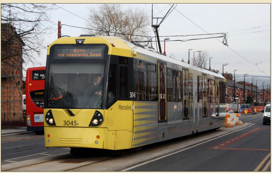
Above: One of the new Bombardier M5000 trams is pictured in the turnback sidings at Droylsden on the opening day of the East Manchester line from Piccadilly. Overnight and daytime testing will shortly commence on the section beyond the tram to Ashton-under-Lyne. lan Royston

In Droylsden and Audenshaw, road traffic was amended from 15th July, prior to tram testing along the new line to Ashton-under-Lyne. The changes include the new reserved tram-only lane along Droylsden Lane, which will be clearly marked in red. Transport for Greater Manchester says testing and commissioning will commence soon with overnight tram tests