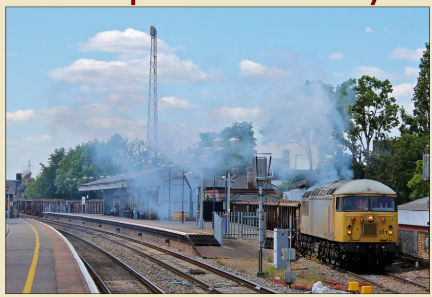
Above: DCR Class 56/3 No. 56311 kicks into life at West Drayton, working the first operation of the 13:15 spoil train from Thorney Mill to Calvert, running via Oxford, on 3rd June.