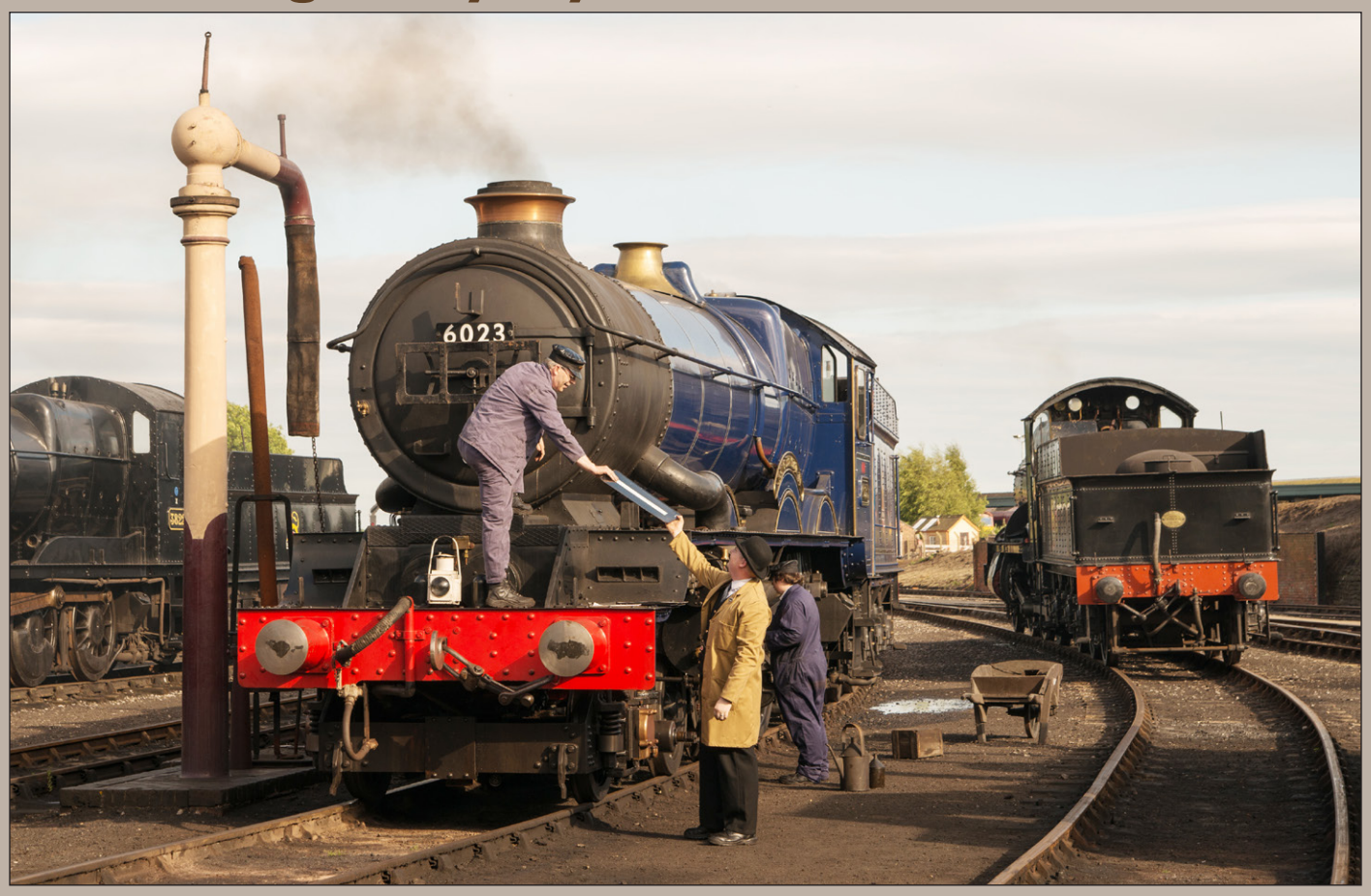
Above: The shed foreman passes up the route indicator numerals to the driver of Collett GWR 6000 class 'King' 4-6-0 No. 6023 King Edward II. The locomotive is surrounded by less glamorous motive power.

Below: As dusk falls, the dim interior lighting highlights a wealth of period detritus along with two stalwarts of the Great Western Railway, No. 7808 Cookham Manor and 'Large Prairie' tank No. 6106.