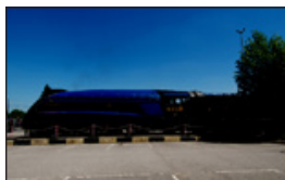
Image is heavily backlit

Looking towards the sun or in a night shot, looking towards a bright light can give a backlit image that makes the foreground too dark.