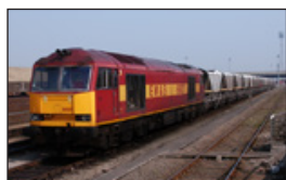
Image requires editing. This may relate to sharpness, brightness, or general composition.

Sometimes contributors will upload the wrong image or multiple images and can use the Caption box to advise moderators that the picture should be deleted.